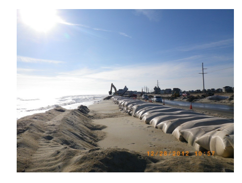
Sandbag reconfiguration and replacement, S-Curves after Hurricane Sandy

The lessons learned from recovery efforts necessary after both Hurricanes Irene and Sandy continue to facilitate quick response to this physically dynamic area. Close collaboration between NCDOT and both federal and state agencies allowed the NCDOT to succeed in restoring the transportation corridor quickly and build a model for future disaster response.