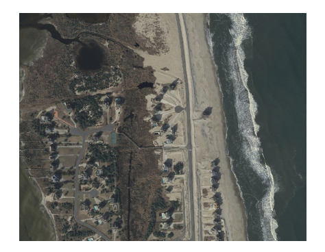
Rodanthe Breach Immediately After Hurricane Irene and After NCDOT Repairs

A few months after completion of the temporary bridge and re-opening of the road, the Pea Island inlet began to migrate southward, threatening the stability of the southern approach to the temporary bridge.