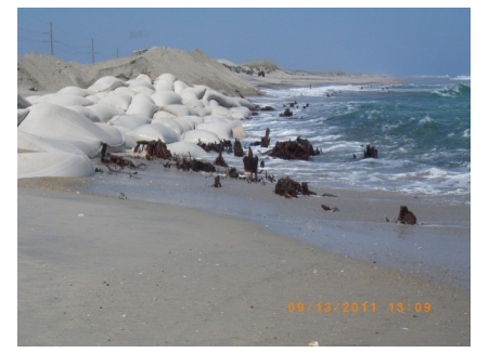
Remnant forest at S-curves after Sandy