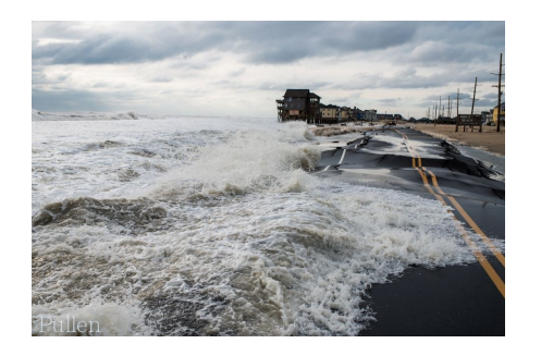
S-Curves, Hurricane Sandy